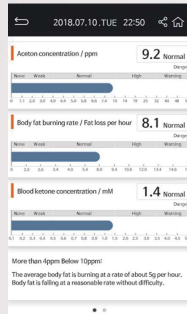
Your breath acetone analysis Check out the speed of body fat burning and blood ketone level based on your breath acetone level. And App. will give you a comment about your body fat burning state.